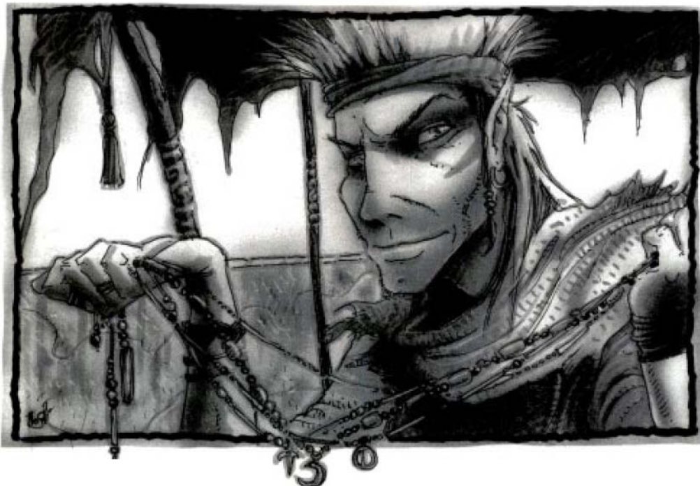
© Wizards of the Coast (2002).