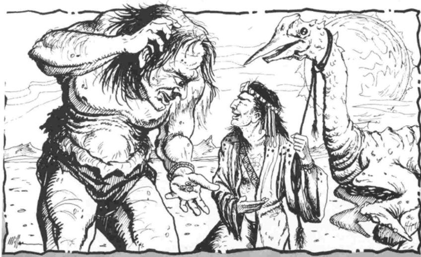
Figure 6: Communication Problems.