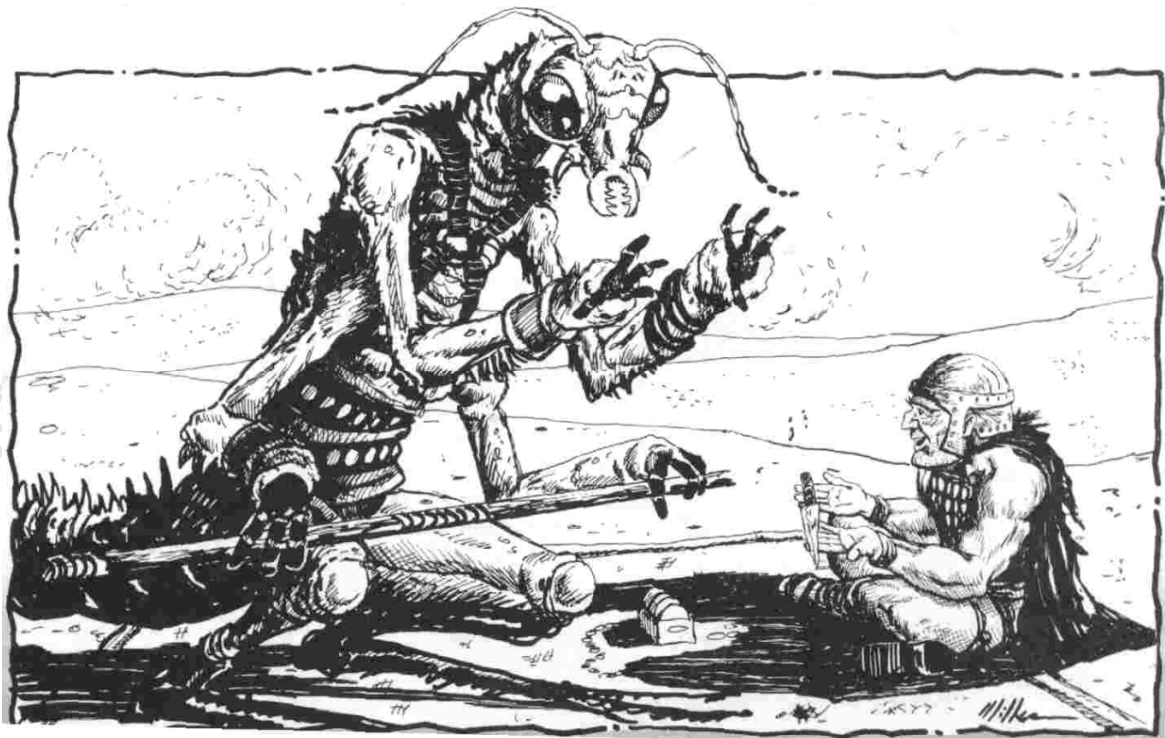
Figure 7: Trade across the cultural gap

This article introduces a new aspect to Athasian trade - the cross-cultural gap. The cultural differences between the various city states and races affect customs and rituals associated with trade. Dune Trader contains information on dealing with various races, but very little information on the cultural differences between the various city states.